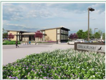
The Landing 2800 Turning Creek Ln

Residents and Staff inside the Fitness Center are NOT permitted to grant access.