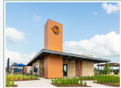
The Waterhole 31427 Cross Creek West Blvd