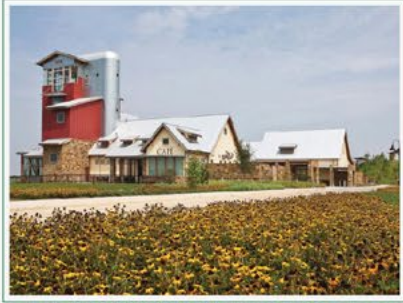
Cross Creek Ranch 6440 Cross Creek Bend Ln